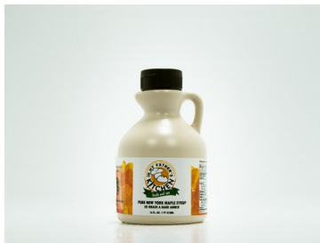
Pure Maple Syrup harvested