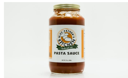
Gluten free, meatless and kosher