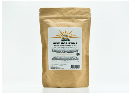
Whole bean only