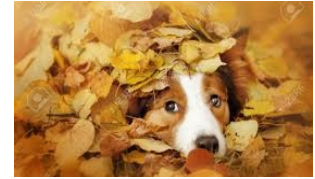
I want to Taste and See!

Thank you for your continued support! Together we are Building Hope and Changing Lives!